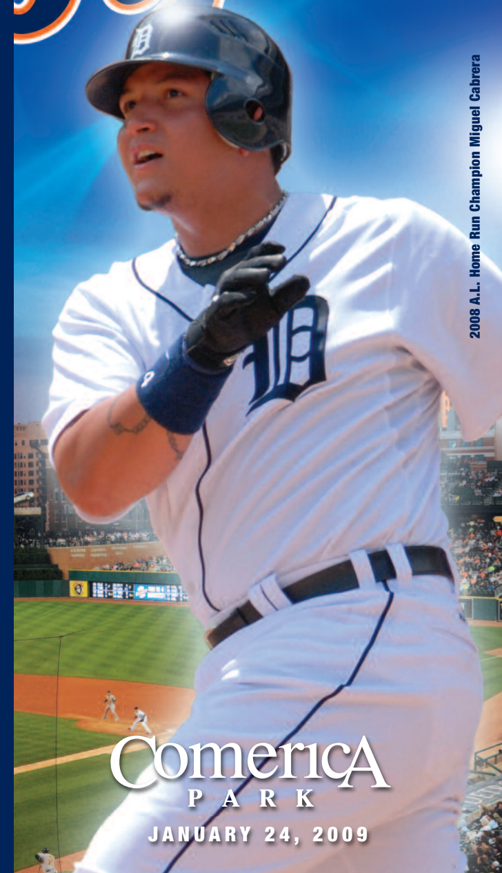
2008 A.L. Home Run Champion Miguel Cabrera